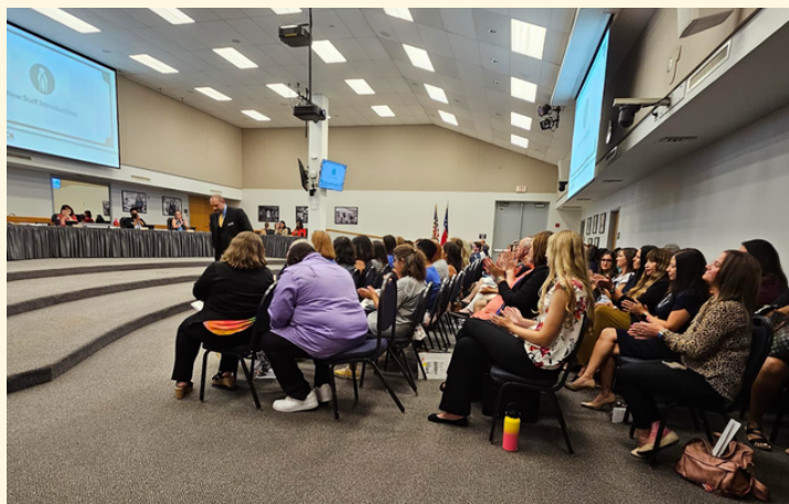
Round Rock ISD School Board Meeting, held earlier this year on August 17